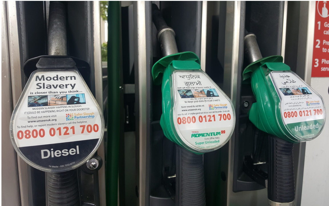
Figure 4: Examples of Safer Slough Partnership Modern Slavery Imagery on Slough Petrol Pumps

5.16 The Browns Project: The SSP have continued to fund the specialist Browns Provision, to provide intensive practical and emotional support to people living in Slough, who are suffering with multiple disadvantages which may include homelessness, substance misuse, domestic abuse, low level offending, unemployment, and mental ill-health, in order to support them in achieving positive changes within their lives. A range of positive outcomes for those engaged with the service have been achieved including, decreases in arrests and reduced calls to the police, no longer selling drugs, maintaining accommodation, and full-time