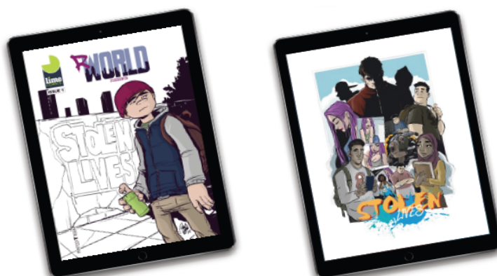
Figure 3: Interactive digital stories, the Choices Programme

5.11 The Choices Programme: Through interactive digital stories, the Choices Programme supports young people in understanding the process of making 'good' choices, and what can drive/influence those choices; it moves beyond 'symptoms' i.e. gang involvement, violence, exploitation etc. to tackling 'causes', therefore equipping young people to better manage all issues they may encounter in today's society. The programme builds the knowledge, skills, and motivation to make better-informed decisions. Over 1000 sessions of the primary phase have been delivered to pupils in Slough, with 3280 year 5 & 6 students taking part. The year 7 element of the secondary phase of the programme has been co-designed with local schools, and other key stakeholders such as the Engage Team, Youth Parliament and SSP; delivery of this phase will be piloted during the current (2019/20) academic year. Design of the year 8 element is scheduled for the 2020/2021 Academic year.