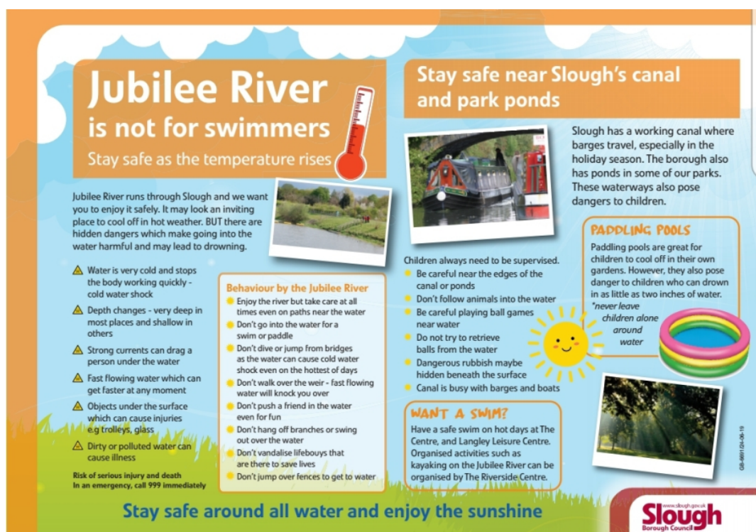
Figure 5: Jubilee River leaflet

5.19 The Jubilee River: Following 2 deaths by drowning in the Jubilee River which runs through Slough, representatives from SBC, the environment agency, TVP, RBFRS, and The Riverside Centre worked together to prevent people from swimming in the river. Activities included the replacement of fencing, signage detailing the dangers of swimming in the river, delivery of water safety talks in schools, and the dissemination of leaflets and information, including within the local press. In 2019, there were no deaths by drowning in the Slough stretch of the Jubilee River.